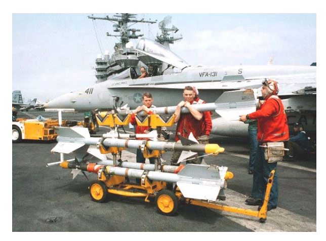
Figure 4 integrating an air-to-air missile to an F-18 aircraft

<u>Ideal Payload Integration</u> The process to join aerospace vehicles on the deck of aircraft carrier represents an ideal with respect to time and cost. The joining of an air-to-air missile to the pylon of an F-18 is completed from carrier to aircraft by a team of five in two minutes. Avionics and robust motorized pylon design enable rapid and verified joining.