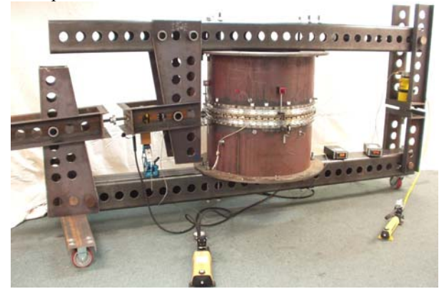
Figure 12 Strength test fixture

The Strength test fixture uses a stiff steel frame and hydraulic rams to apply flight-like loading. Additional tooling approximates the local stiffness and flatness of real space vehicles.