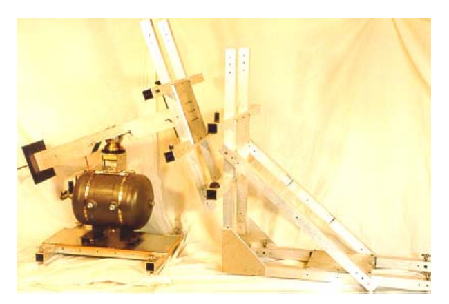
Figure 14 Separation Reliability Fixture

The Separation reliability test fixture frictionlessly offloads gravity torques, allowing the Lightband to separate as it will in orbit. A spherical air-bearing allows pitch, roll and yaw; a planar air bearing allows translation. The separating half (supported by the air bearing) is instrumented with an inertial measurement unit, which coupled with measurement of the separating half's mass properties, allows accurate verification of tip-off rates and delta V. Additional instruments record time, current and voltage to separate. The reset-ability of the Lightband allows engineers to execute statistically significant number of tests (at least 10) yielding maximum, minimum, average and standard deviation of all of the readings.