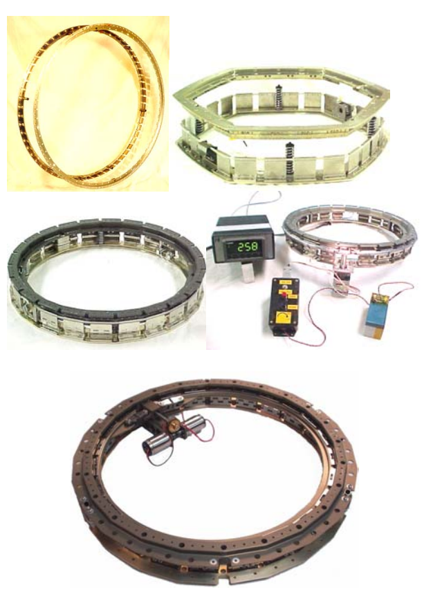
Figure 11 Five Lightbands sequentially developed from 1998 to 2002

five major iterations of the design before the production efficiency was possible. PSC's self-serving need to posses a broadly applicable, high performance product that was not only easy to manufacture, but easy to test, did not come easily. This was due to the inability of present analytical techniques to thoroughly predict performance of mechanisms. Unlike structural design, which generally benefits from isotropic and continuous material properties, mechanisms are intentionally (to let them operate) loaded with a series of difficult to analyze discontinuities. So to come up with a good design, many prototypes had to be made, tested and improved. In the course of development, many promising technical solutions were abandoned because their recurring cost proved to be too high. Over time the trend in the Lightband development has been to increase specific stiffness, specific strength while reducing total production, test and integration cost. The motorized Lightband was the final product of the development effort. The actual use of Lightband on many small satellite missions proved effective in giving PSC engineers feedback on areas for improvement.