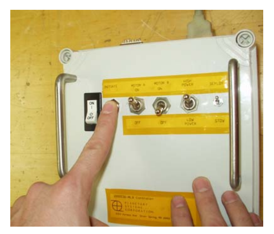
Figure 8 Push of a button on the controller sets Lightband