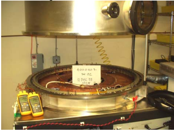
Figure 15 Thermal Vacuum chamber with 38 inch Lightband

A thermal vacuum test chamber was made to test the Lightband in the vacuum and temperature extremes of space. The Lightband is typically cycled eight times between temperature extremes, at 10-6 torr. During the ninth cycle, separation is initiated. With the motorized Lightband, the Lightband can be reset, to repeat the test without breaking vacuum.