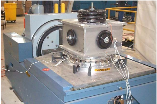
Figure 13 Vibration test fixture, Lightband and electro-dynamic exciter

The Vibration test fixture is designed to emulate the mass properties of adjoined structures