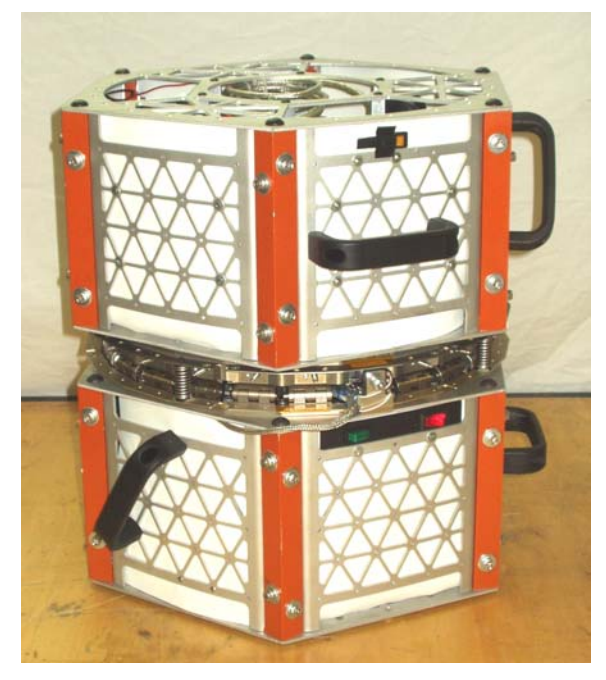
Figure 9 Ready for Flight