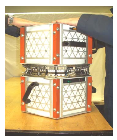
Figure 7 The satellites are joined using integral clocking and alignment features