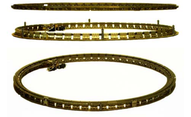
Figure 2 The 38.81 inch diameter Motorized Lightband manufactured by Planetary Systems Corporation (PSC)

Separation systems have two primary functions. The first is to rigidly hold two adjoining vehicles together for shipment and launch. The second is to affect separation of those vehicles upon command from an adjoining vehicle.