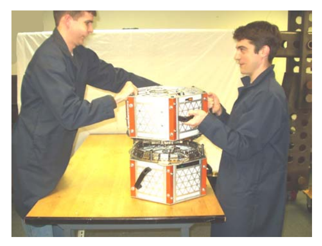
Figure 6 One satellite is place on the other